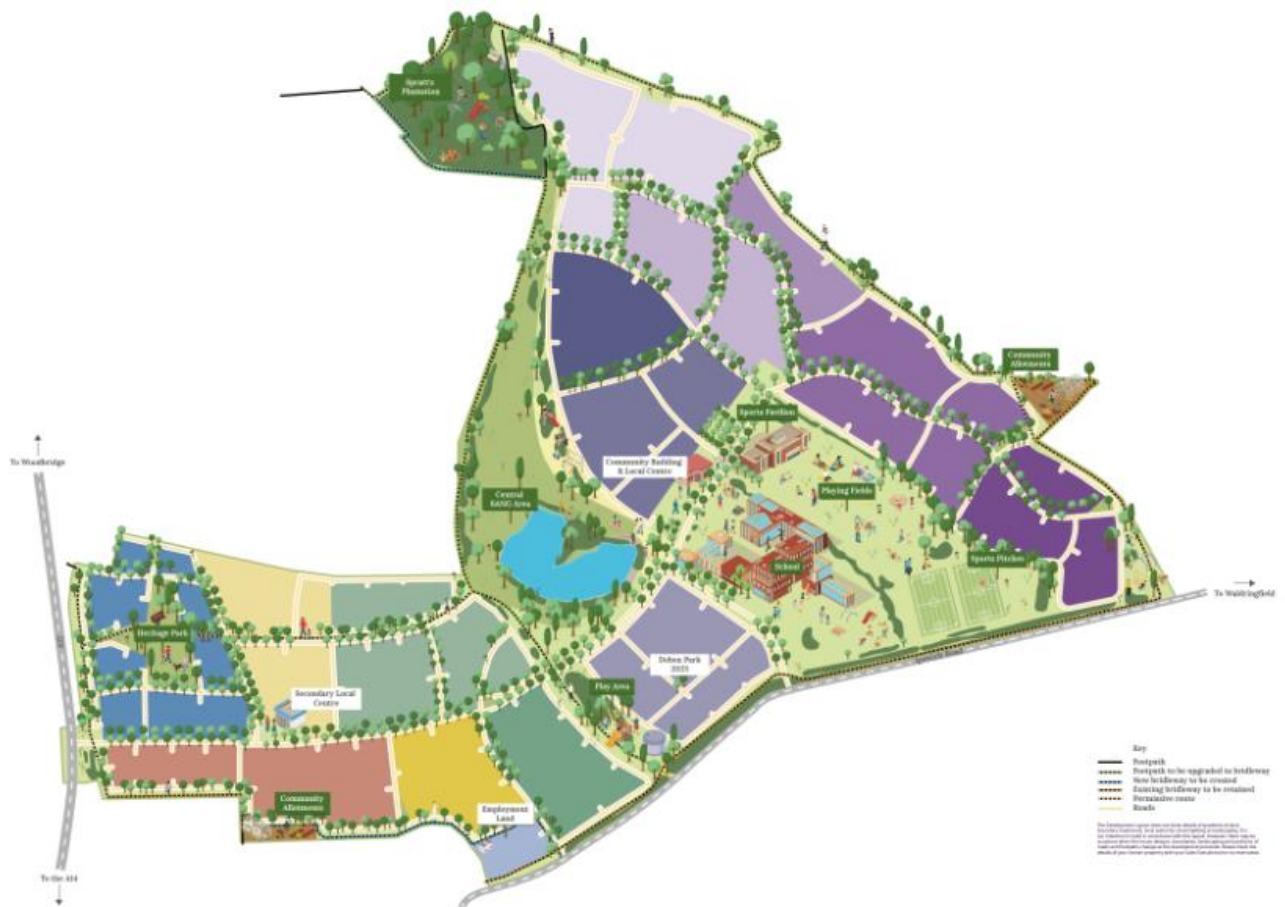
Figure 2 - School location identified on the above plan, from Taylor Wimpey's details of the development at https://www.taylorwimpey.co.uk/new-homes/martlesham/brightwell-lakes .

A school site is included in a S106 agreement, indicative plans for the new school follow.