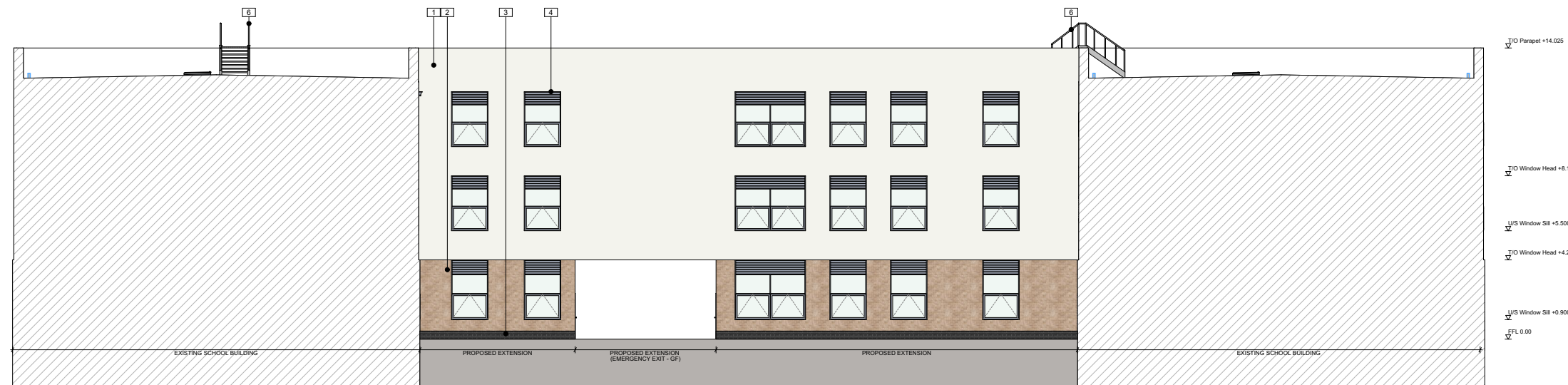
EXTENSION TO EXISTING BUILDING - NORTH ELEVATION