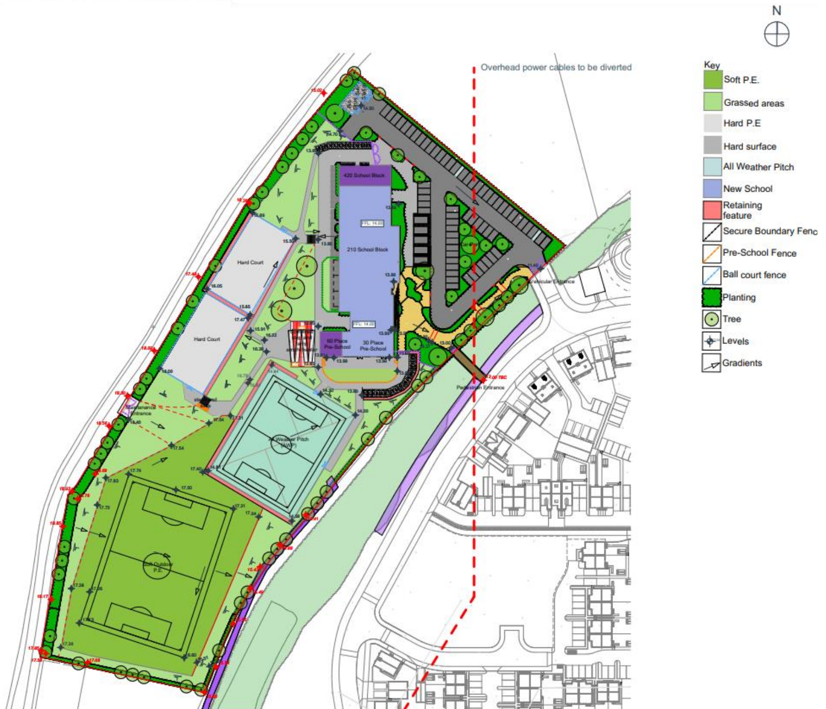
Figure 3 - Proposed site plan for new school, currently in design. Design shows the layout for both phases of work. Plans correct as of 10 January 2025, final co-ordinates have not yet been agreed.