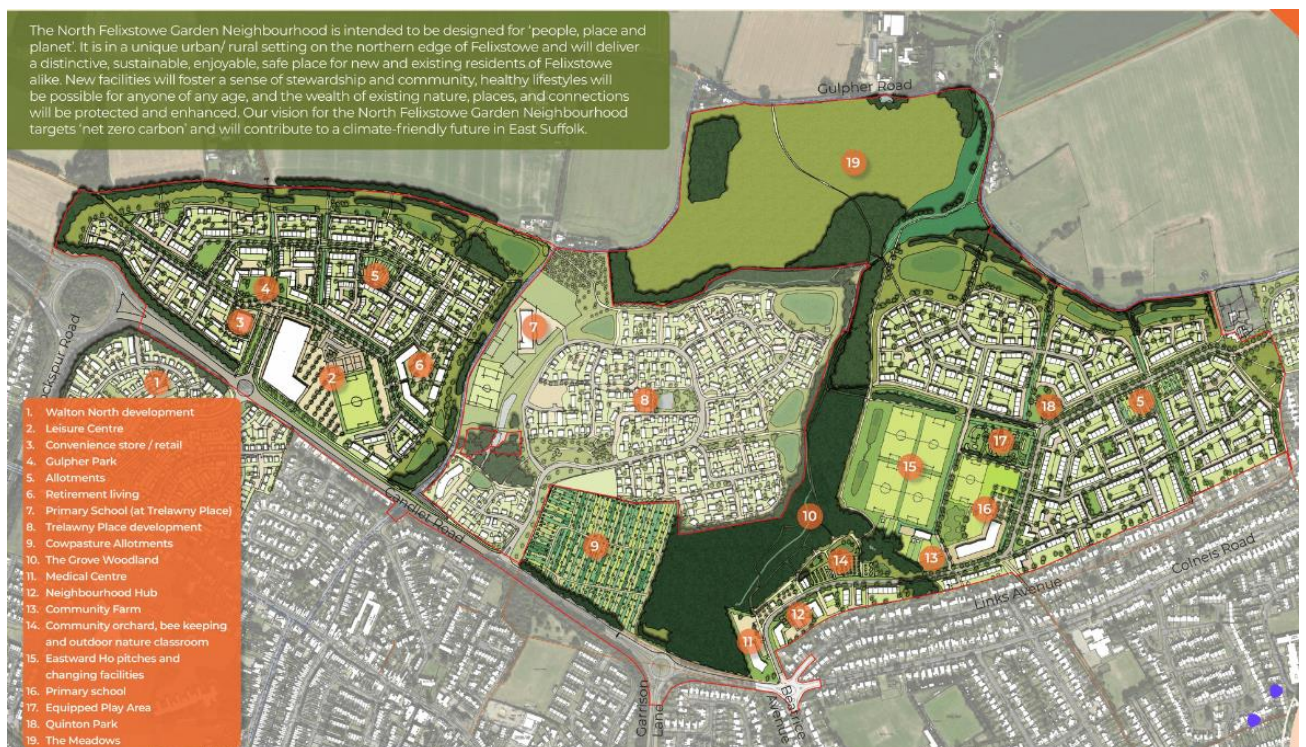
Figure 2 - School location identified on the above plan (item 7), from East Suffolk's North Felixstowe Garden Neighbourhood website. The location of other services including the second primary school is as yet unconfirmed and may change from the location shown above.

A school site is included in a S106 agreement, indicative plans for the new school follow.