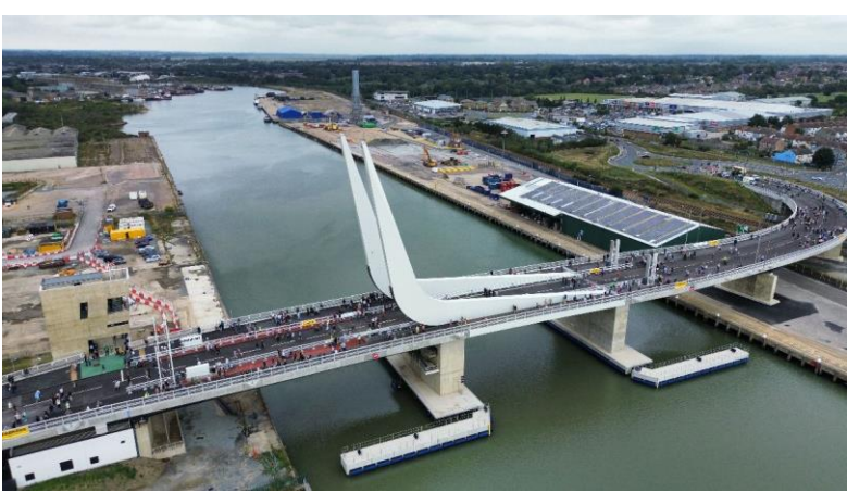
Aerial shot of bridge