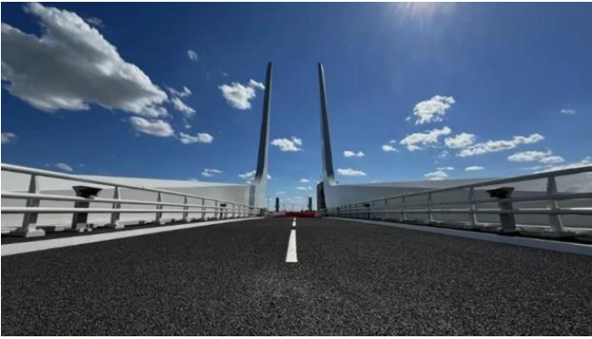
Road surface and bascules

S106 funding for the project totalled £475,000.