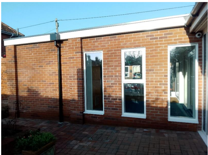
Rear exterior of new foyer