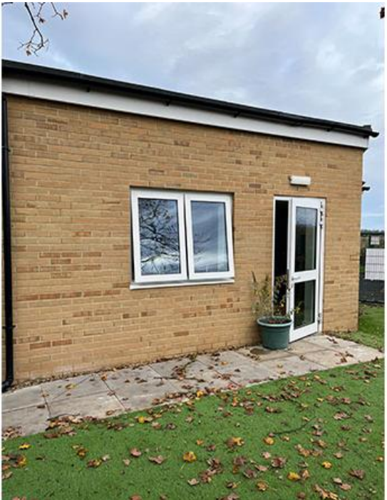
External of extended year 1 classroom