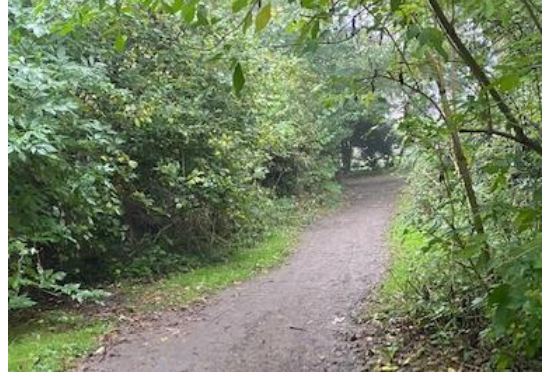
Previous Footpath surface at Stowupland High School

Projects costs are anticipated to be £14,950, funded entirely by Mid Suffolk CIL.