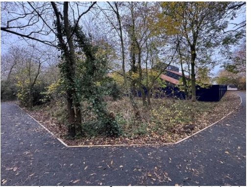
Footpath with new surface at Stowupland High School