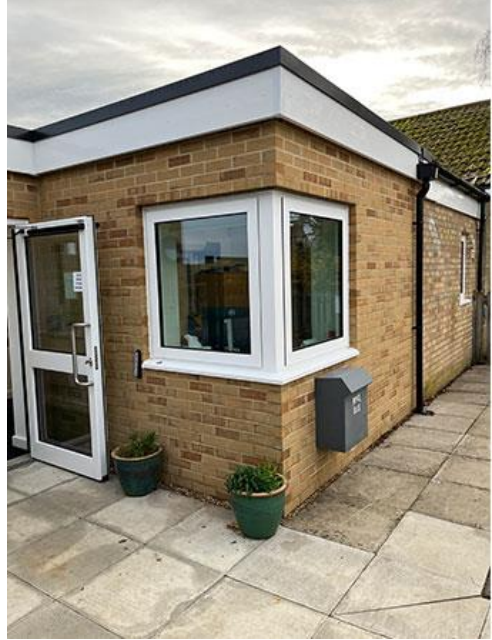
External of extended reception and admin area