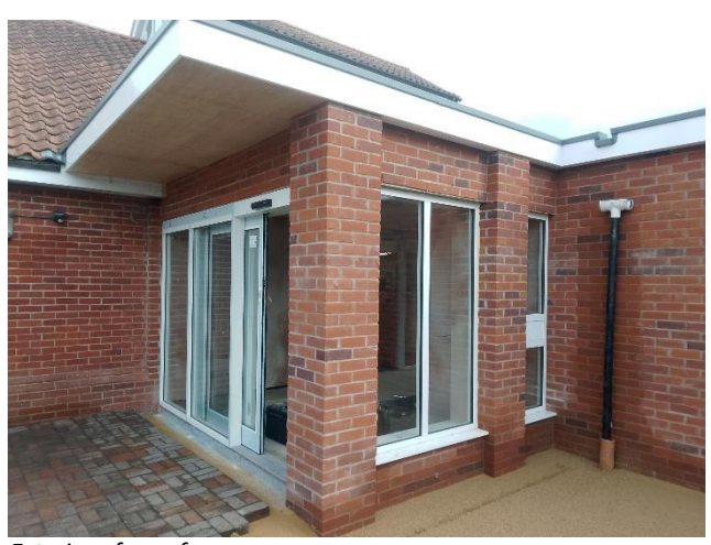
Exterior of new foyer

£44,168 of S106 has been spent by the libraries service this year on capital building works and revenue, which has included book stock and resources for various libraries.