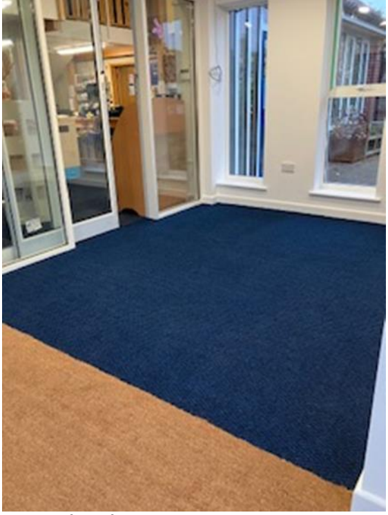
Interior of new foyer

The project was funded with £32,400 of East Suffolk CIL awarded in September 2023, along with contributions from SCC capital funding and the Friends of Bungay Library community group.