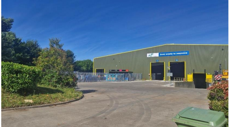
Exterior of new HWRC building