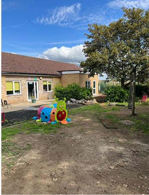
External play area

Project costs were £545,532 which included £473,000 of S106 funding.