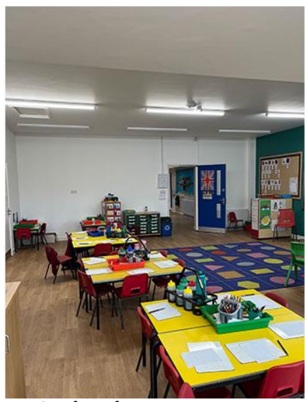
Interior of new foyer