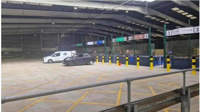
Interior of Haverhill HWRC