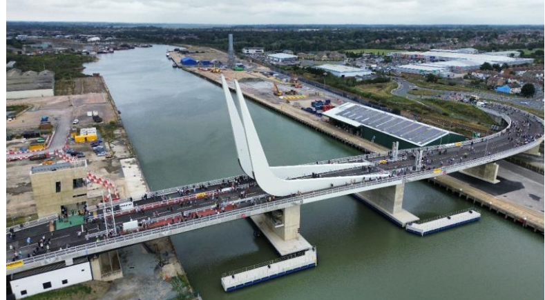
Gull Wing Bridge, Lowestoft

This statement also provides some examples of infrastructure projects delivered by SCC.